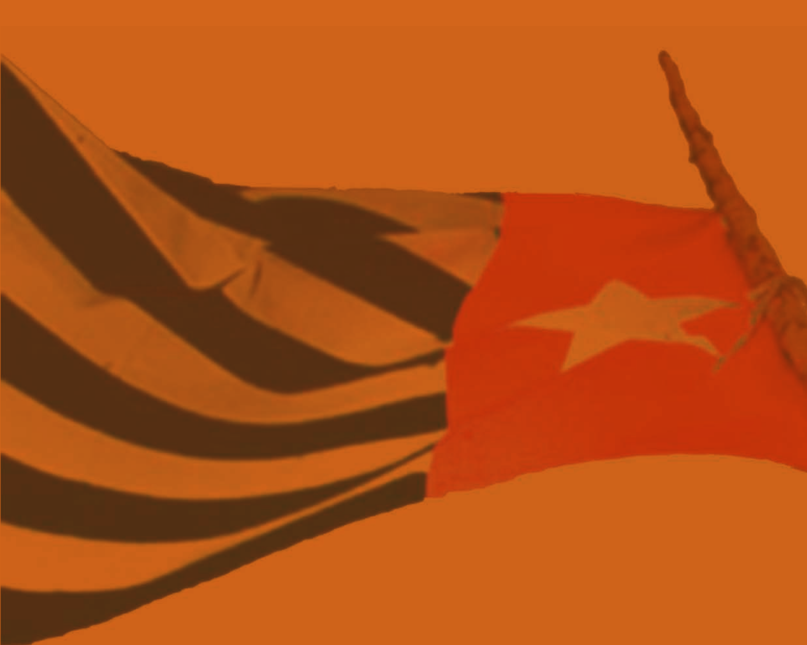
Back Cover: Imbi Square, Jayapura/Port Numbay, West Papua, June 2000