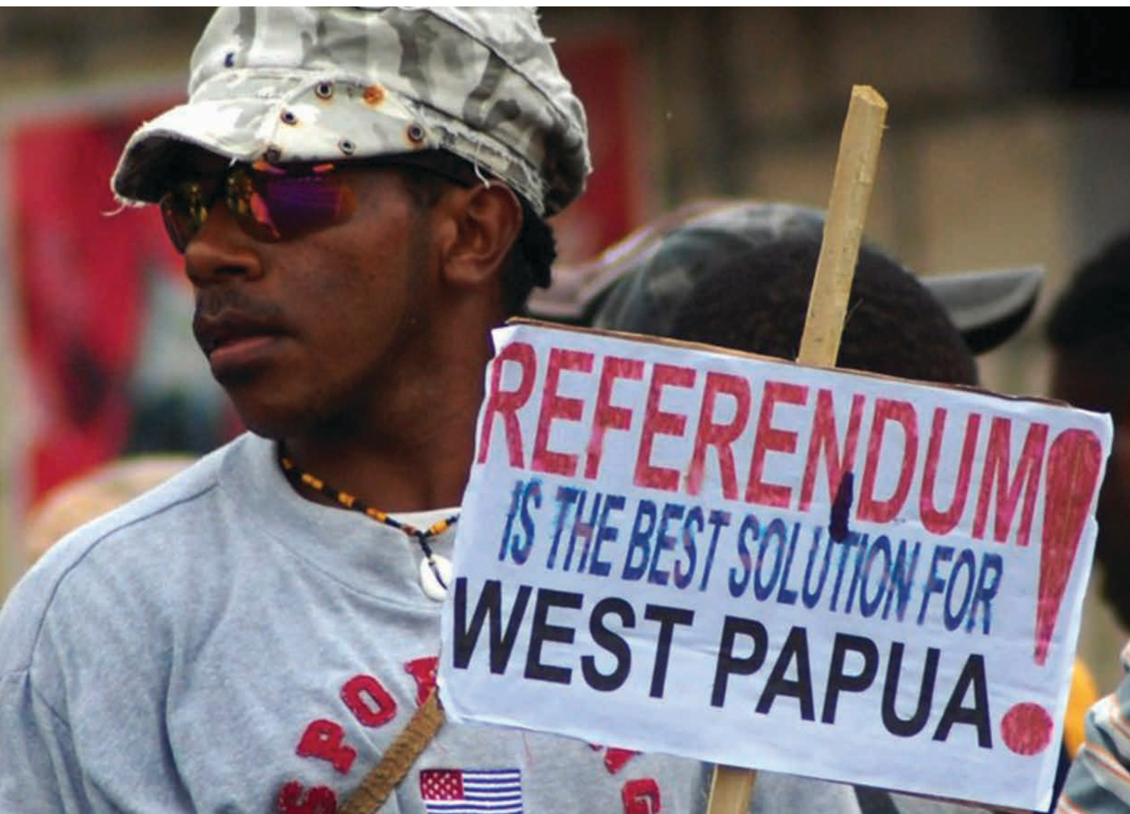
Demonstration, West Papua.