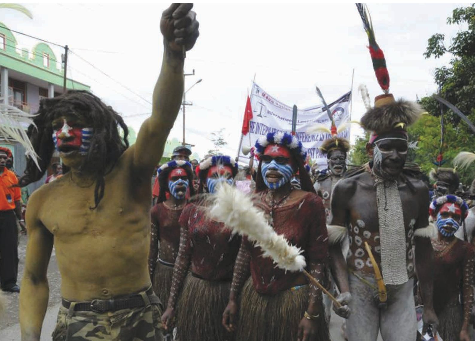
Demonstration, West Papua.