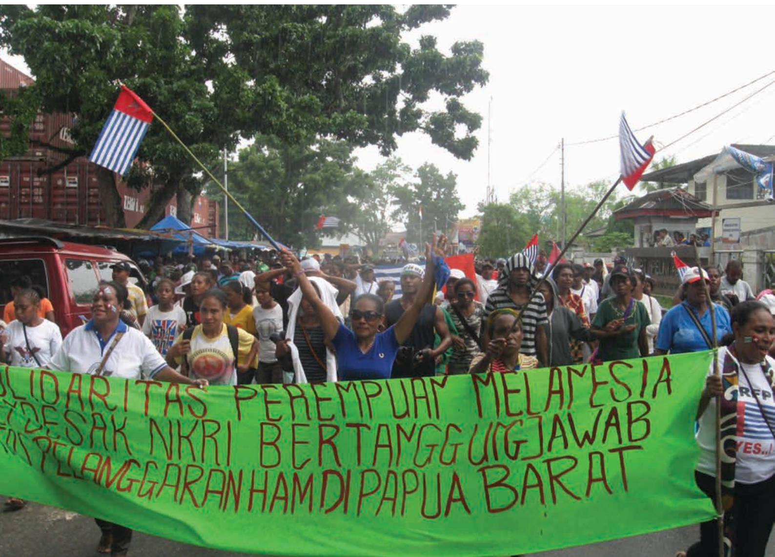
Women's action, 2013, West Papua.