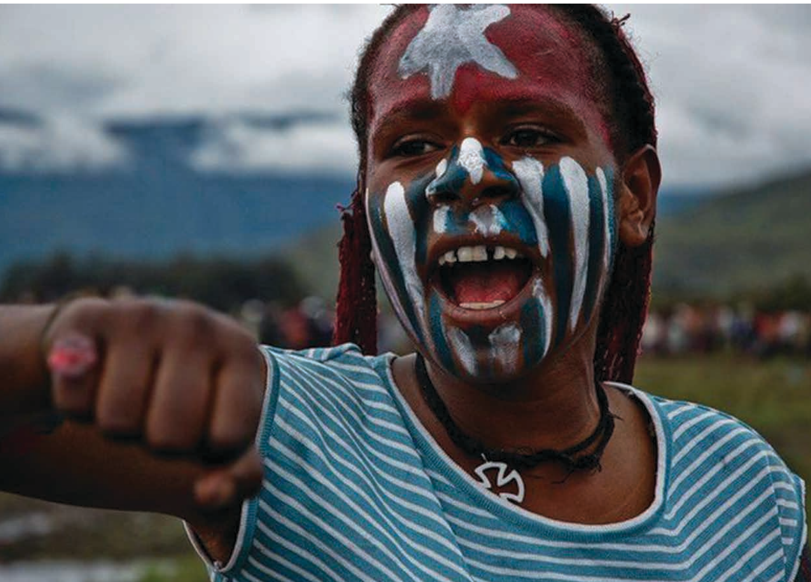
A young girl proudly displays Morning Star face paint, Wamena.