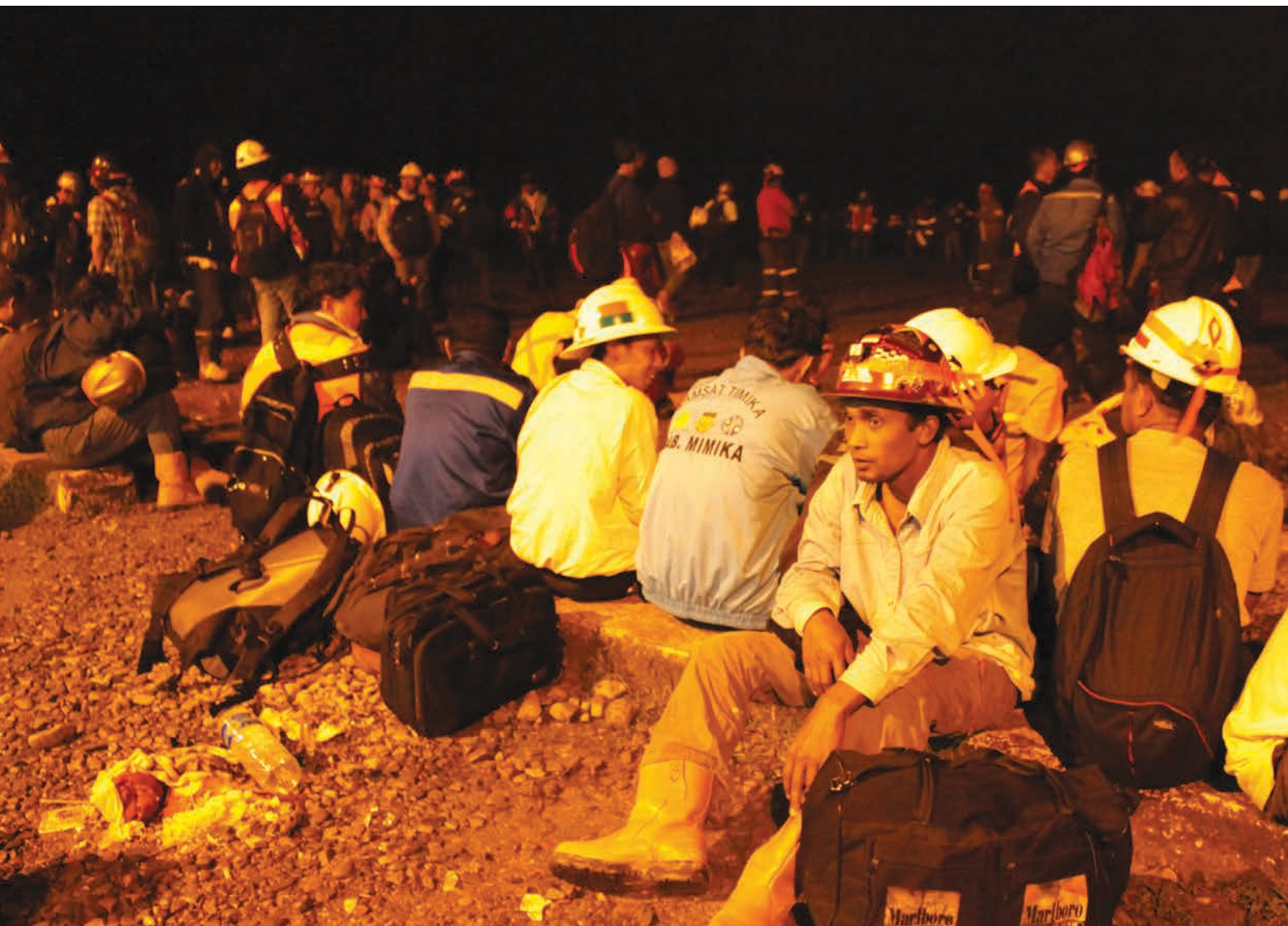
Freeport long night march.